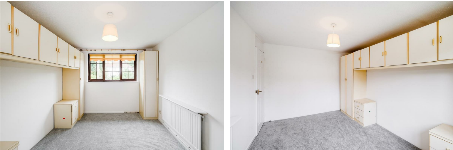
FIRST FLOOR 482 sq.ft. (44.7 sq.m.) approx.